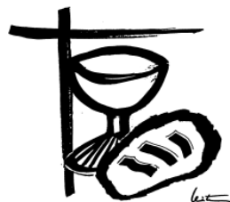
Gift of God

We ask this through Jesus Christ our Lord. Amen.